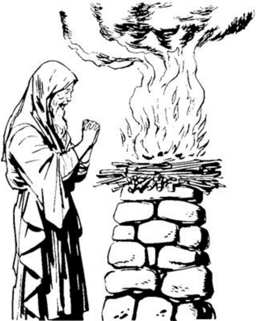
Ahaghiro ha koruuseri amaruusi (8:20)