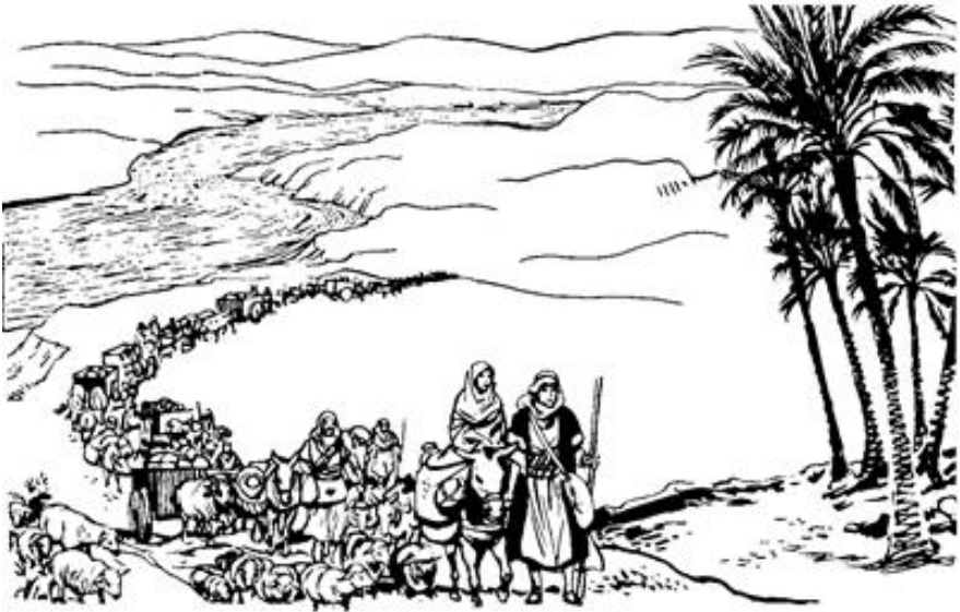
Yakobho na abhaato bhaache bhaaghaye Miisiri (46:1)

Bheeri-Sheebha, akaruusi amaruusi kwo Ryobha re Isaka, ishe waache. 2 Hano obhotiko bhusöhiri, Eryobha rekamobherekera Yakobho mo-marighi, “Yakobho, Yakobho!”