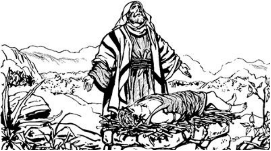
Abhurahamu ^akaruusi omoona waache amaruusi (22:10)

Hano amariri akamubhöha mwereeti waache Isaka, akamuraari ighoro e chaaku chiire. 10 Aghaghöröröki okubhökö kooche akiimoki eghighësö, kubha amosinche mwereeti waache.