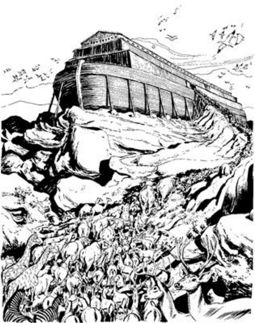
Asafina e Nuhu (6:16)

marëngö atato, eribhaara erimu ootoore orwighe, ukörë eghisara, oramara otighe omweya, eriiteneka re kubhökö kumu, riyo ribhe ghatte e ghisara ne erirëngö.