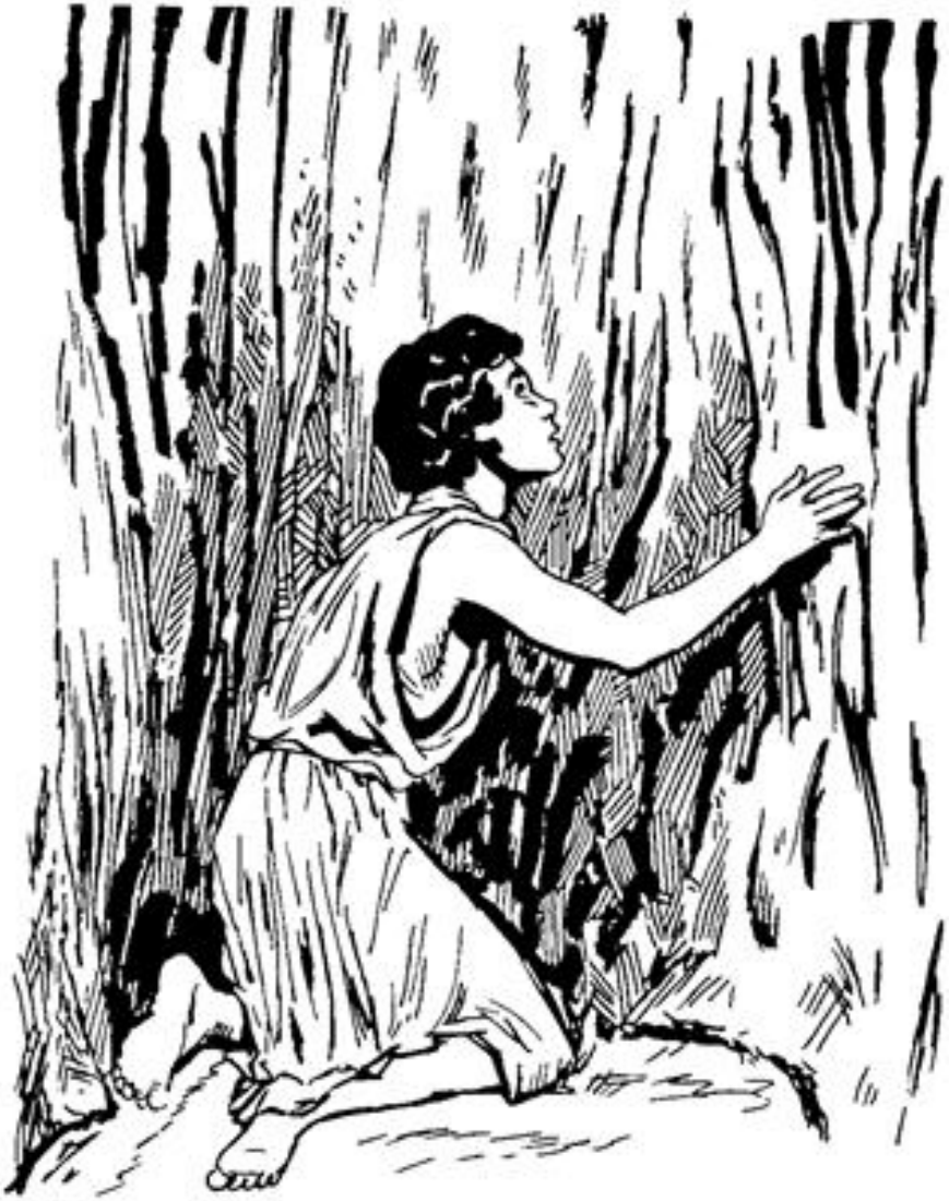
Yusubhu ^akarëkëru mwiribha (37:24)

23 Hano Yusubhu abhahikiire, bhawomoobho bhakamoruusi angibho yaache yiire anchömu. 24 Bhakamara bhakamughööta, bhakamurëkëra-mu. Amare eriiribha riyo retaare na amanche.