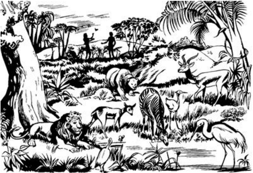
Obhutëemi bho Ryobha (1:31)

30 Chatyenyi choose che se, ne ebhinyönyi bhyose bhe Mwishaaaro, ne ebhetyenyi bhyose bhino bheghughënda mo-se, bhino bheenyi no omwika o bhuhöru, nekobhiha emimërö ghyose e minyariiri ngeekubha ebhiinyakure bheebho.” Ekabha hang’u.