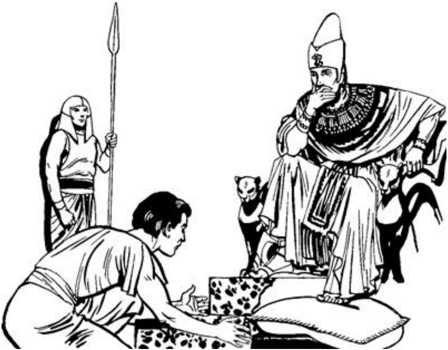
Yusubhu ambërë e mutëmi o Miisiri (41:14)

6 Akamara akarighi wiiki ebhisaawa ebhende bhikërëghësö mohungate, bhino bhyomiru no omukama muhaari o roghoro bherasebhoka. 7 Ebhisaawa bhiyo ebhikërëghësö mohungate, hayo hayo ñbhekamera ebhisaawa bhiire ebhekoro bhichwire chaaheke. Niho Bharaawo aghiitaki wiiki koru mo-chandooro, akamënya kubha n-eriröötö hang'u reere.